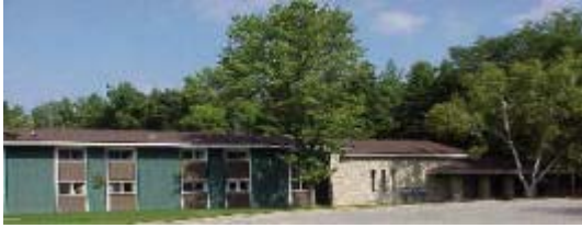
Robbins Hall on left